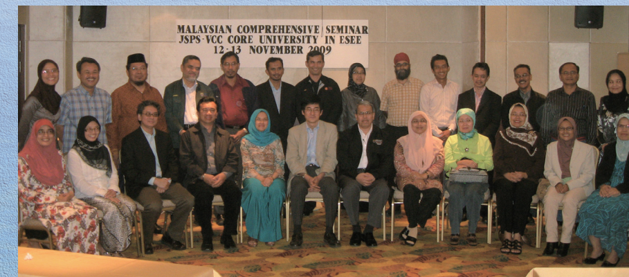
JSPS-VCC Core University Program in Malaysia

the close rapport and networking that has been established over the last two decades is deeply entrenched and will continue to be sustained in other guises. One such effort is the current establishment of an overseas base of Kyoto University in the University of Malaya. We certainly look forward to the continued research activities under this project which involves many of the current research interests of the Research Clusters in the University of Malaya in particular and we welcome the participation of our fellow Malaysian researchers and universities in general.