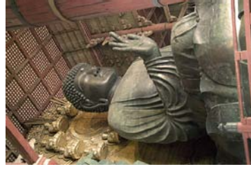
Great Buddha of Nara