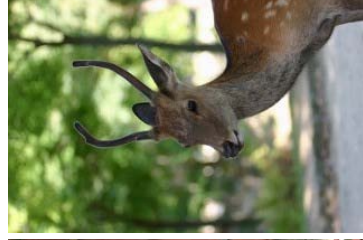
A deer in Nara Park