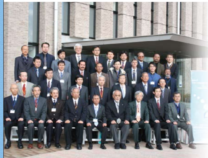
Invited guests and Program members at the Opening Symposium (December 19, 2008)