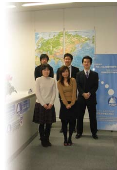
The Staff of the GCOE HSE Center